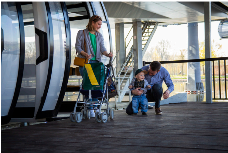
The ropeway ride at Floriade 2022 is an amazing experience for young and old.