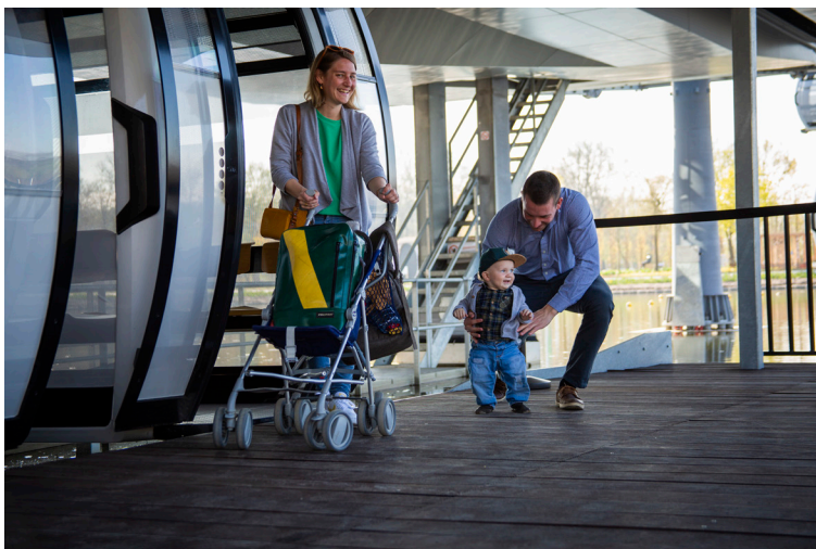
The ropeway ride at Floriade 2022 is an amazing experience for young and old.