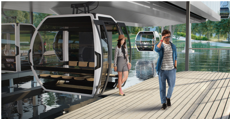
Visualisation of the ropeway station at the Floriade 2022