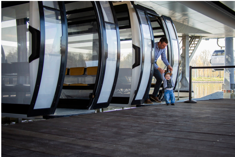
Little visitor of the Floriade 2022 on his probably first ropeway ride.