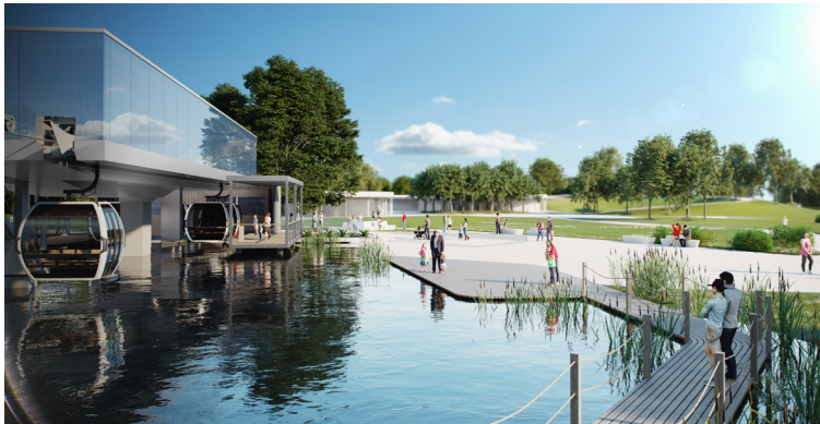
Visualisation of the ropeway station at the Floriade 2022